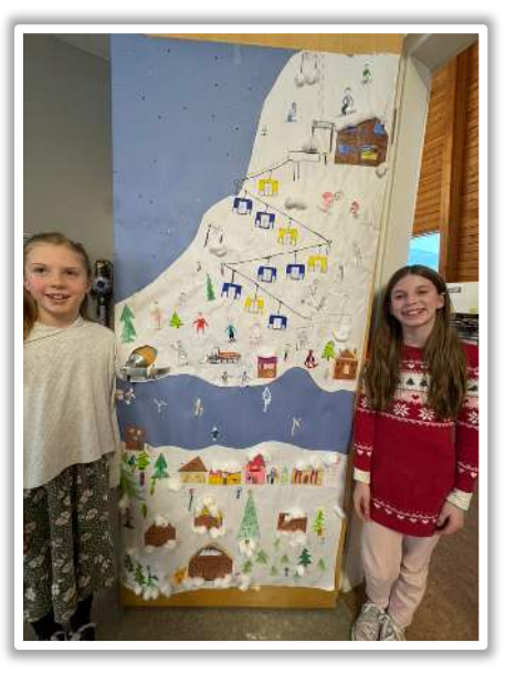
Door decorating filled BVE with seasonal joy!